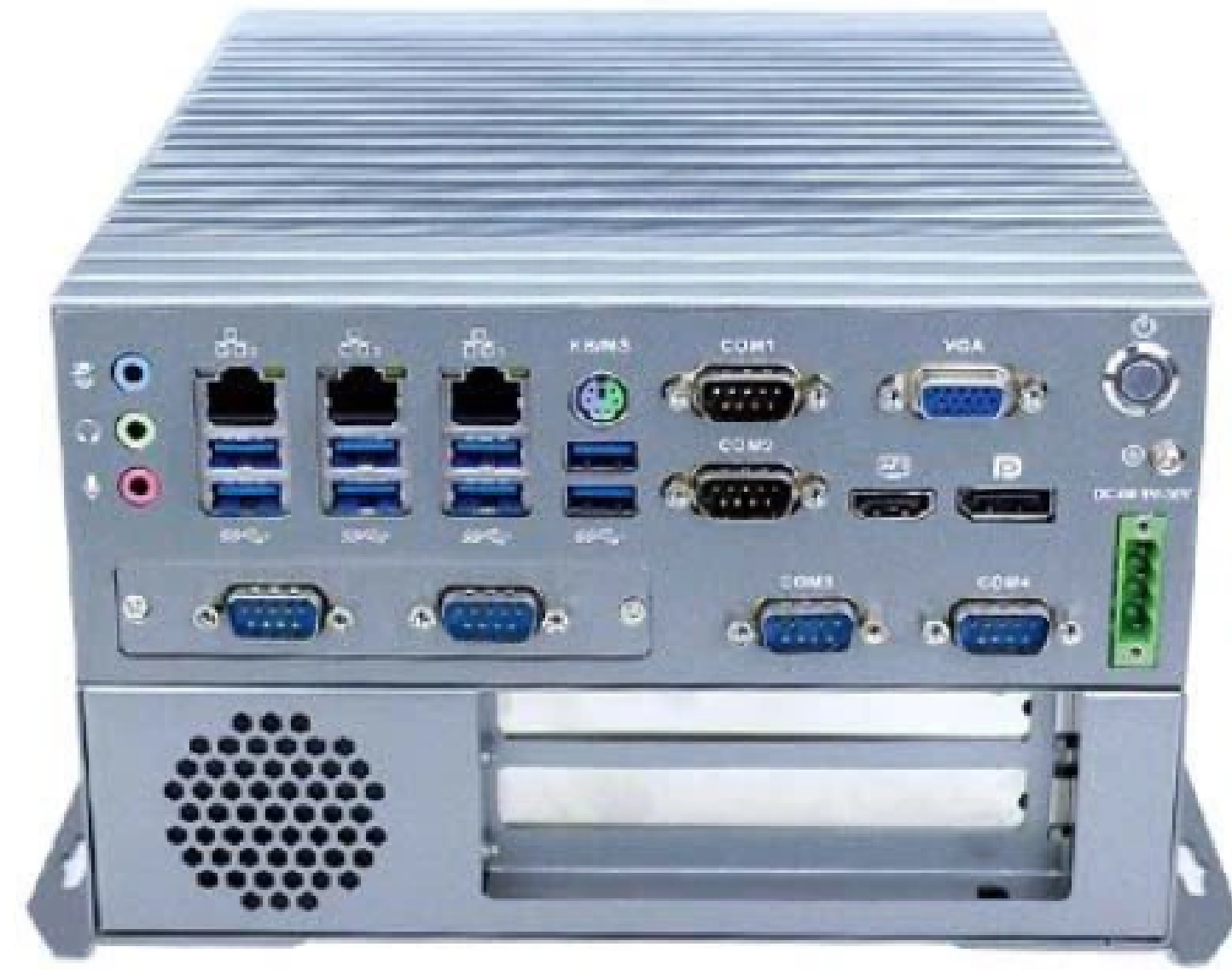
2 Expand Slot