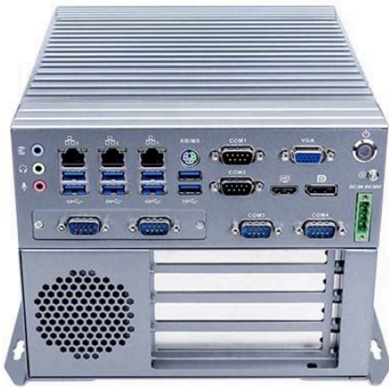
4 Expand Slot