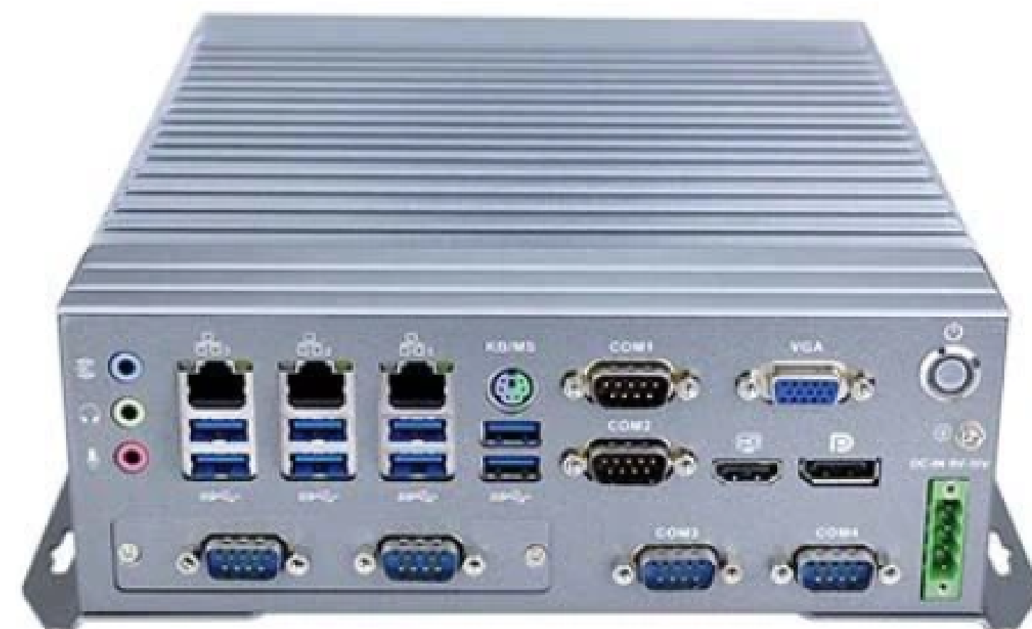
No Expand Slot